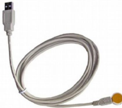
Fig.3. USB External Inductor